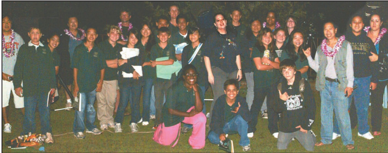
Island Pacific Academy's Astronaut Academy students and teachers gather regularly for nighttime learning under the West Oahu skies.

Do you enjoy taking pictures? We accept good-quality photographs from West Oahu residents. Photos should be in good taste, in sharp focus and depict life in West Oahu. Mail photos to MidWeek Zones, 45-525 Luluku, Road, Kaneohe, HI 96744. Remember to include a description of the photo, the names of all the people in it, your name and phone number. Digital photos are welcome by e-mail to thefner@midweek.com .